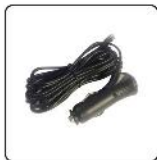
Lighter Power Lead